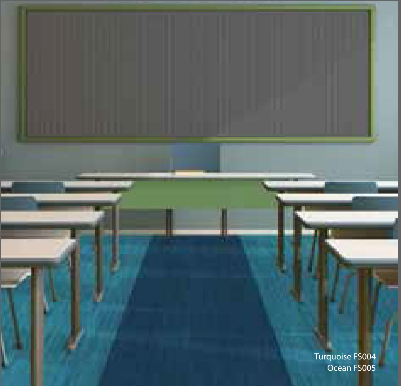
Turquoise FS004 Ocean FS005